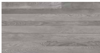
Aspen Gray (AGP)

The printed horizontal plank design creates depth, texture, and dimension.