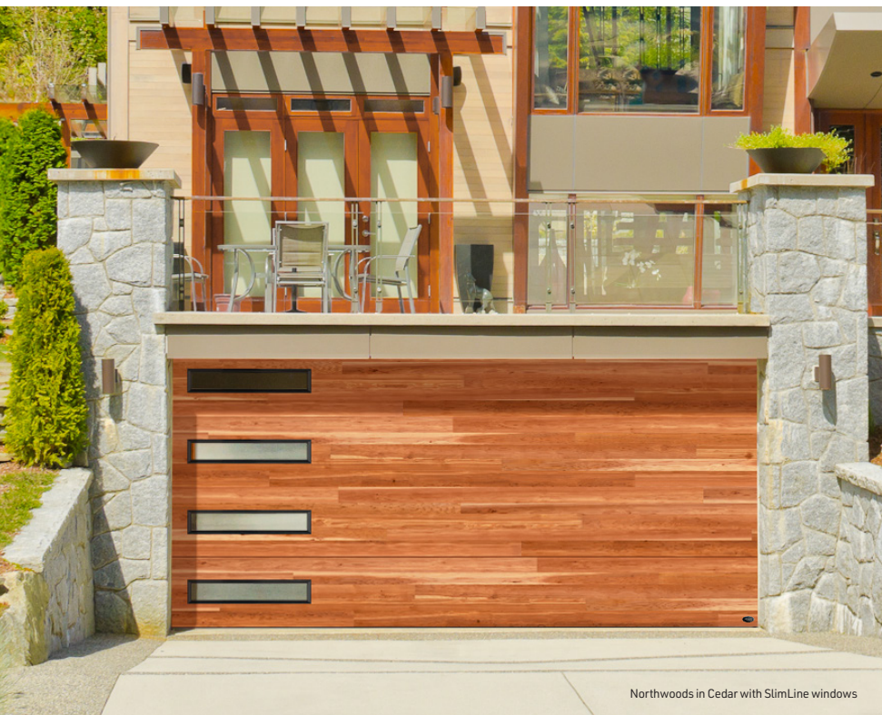
Northwoods in Cedar with SlimLine windows

The printed horizontal plank design on a ribbed section creates depth, texture and subtle dimension. A perfect complement to modern, mid-century modern, and traditional architectural styles.