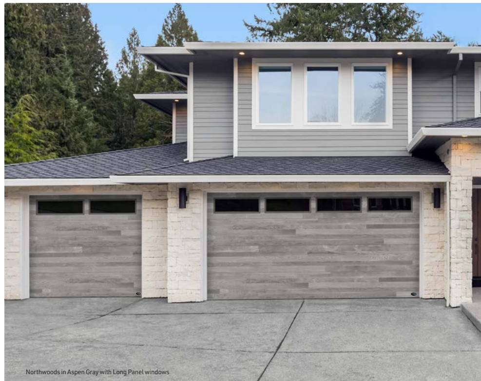
Northwoods in Aspen Gray with Long Panel windows

The multi-hued, digitally printed woodgrain pattern gives a more genuine wood appearance. Available with either traditional or Mosaic Window placement.